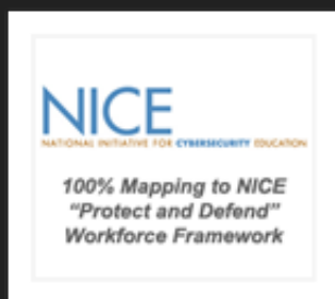
The National Initiative for Cybersecurity Education (NICE)