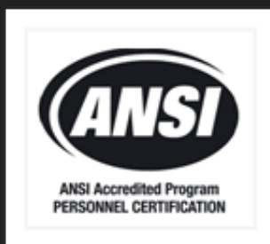
American National Standards Institute (ANSI)